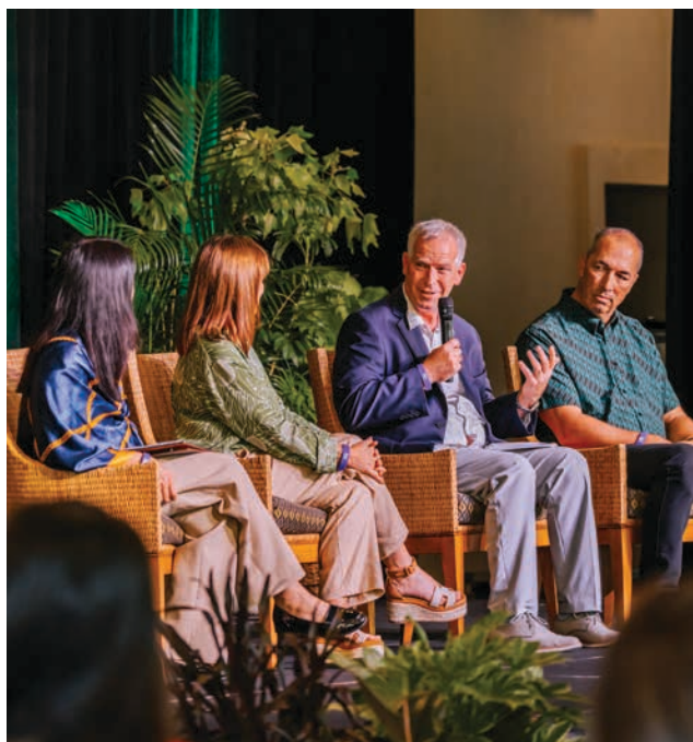
At the 2024 HEC Conference, military and HEC leaders announced a first-of-its-kind MOU affirming their shared commitment to preserve, protect, and perpetuate Hawai‘i’s Soul.

By fostering common ground through Hawai‘i’s Soul and island consciousness, leaders have a path to bridge long-standing divides – bridging the military’s responsibility to protect against global threats with the community’s commitment to place, culture, and people. This alignment also strengthens readiness by better preparing service members to live with island consciousness and serve successfully in Hawai‘i.