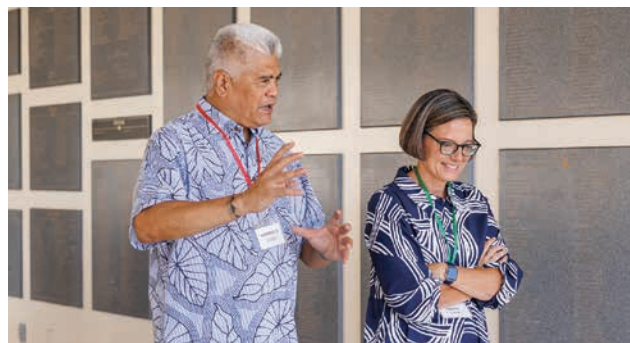
Top leaders from across sectors gathered in May 2025 for a daylong convening, aligning around a collective responsibility to lead with shared values, protect Hawai‘i’s Soul, and steward a thriving future for future generations.

By creating the conditions for alignment, reflection, and shared purpose, this work continues to strengthen relationships and ignite collective action. HEC’s role is not to direct the work, but to enable it – offering backbone support, trusted facilitation, and a deep commitment to place that activates one of Hawai‘i’s most powerful resources: its people.