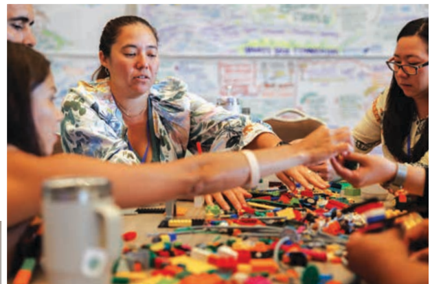
Younger leaders at the July 2025 Hawai'i's Soul convening.